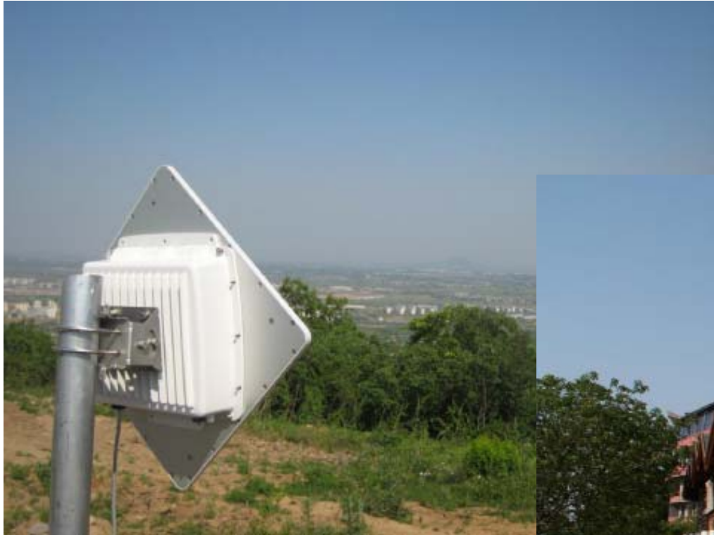
Location of Fang Hill