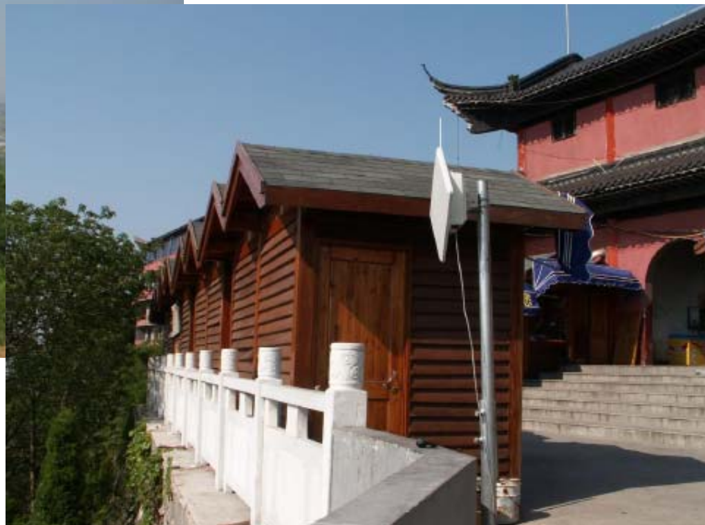
Location Mao Hill