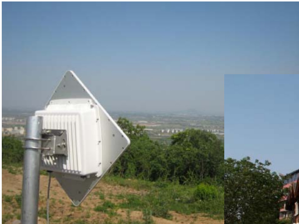
Location of Fang Hill