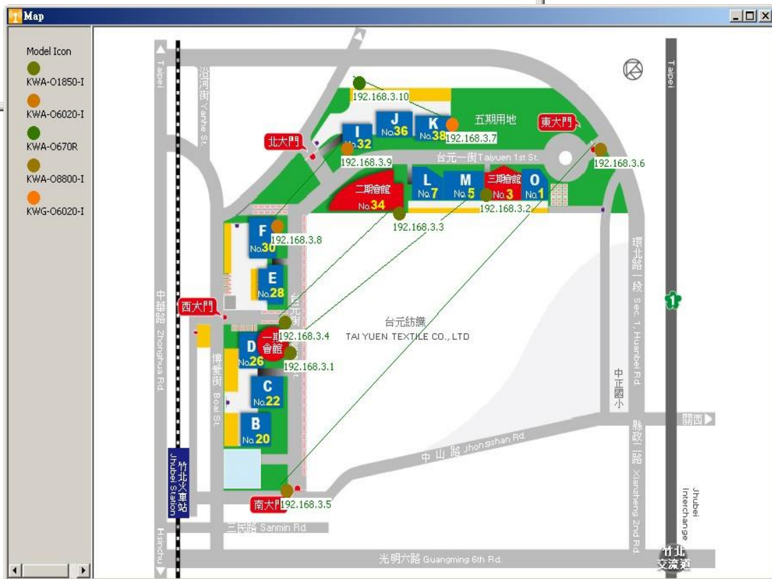
Bridge Location on the MAP