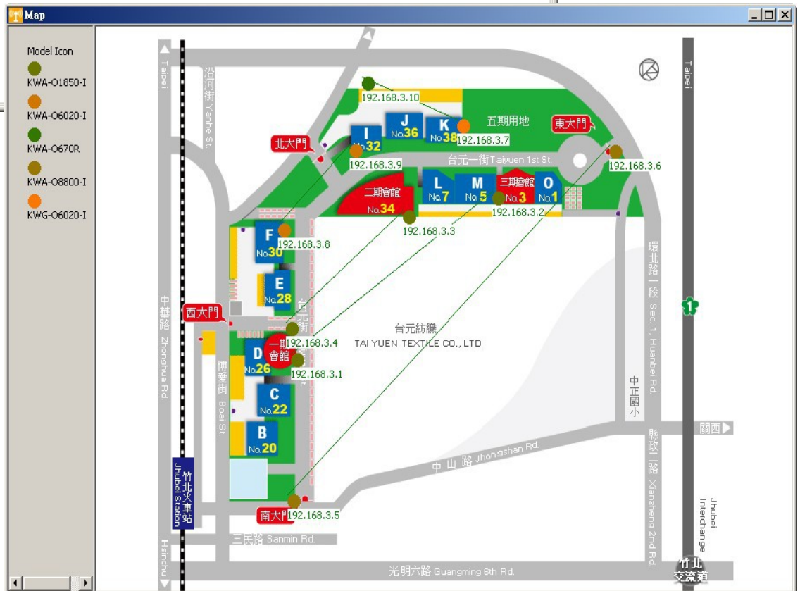
Bridge Location on the MAP